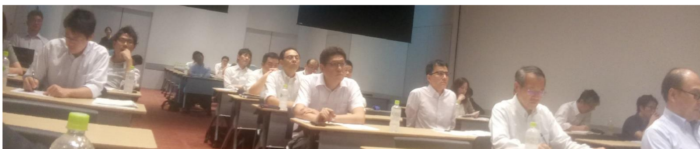
A section of the audience in the X Seminar by Medius Holdings (Jp) & Medinippon Healthcare (In)